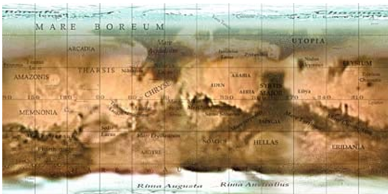
Mars map showing typical features that can be seen with amateur telescopes.

around longitude 180° with the broad streak of the Mare Sirenum. This lies south of the crater Gusev, where the second Mars Rover, Spirit, is on the ground exploring. Mare Sirenum extends westward into Mare Cimmerium (longitude 230°) and then Syrtis Major comes into view again.